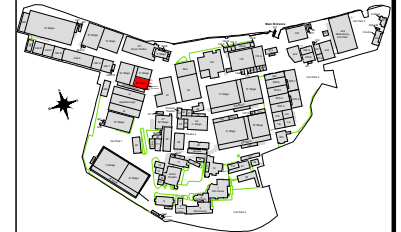
SHEPPERTON STUDIOS SITE PLAN

ALL DIMENSIONS TO BE CHECKED ON SITE PRIOR TO ANY COMMENCEMENT OF WORKS