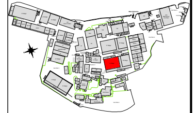
SHEPPERTON STUDIOS SITE PLAN

ALL DIMENSIONS TO BE CHECKED ON SITE PRIOR TO ANY COMMENCEMENT OF WORKS