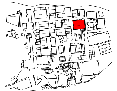
PINEWOOD STUDIOS SITE PLAN

ALL DIMENSIONS TO BE CHECKED ON SITE PRIOR TO ANY COMMENCEMENT OF WORKS