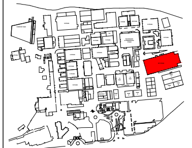
PINWOOD STUDIOS SITE PLAN

ALL DIMENSIONS TO BE CHECKED ON SITE PRIOR TO ANY COMMENCEMENT OF WORKS