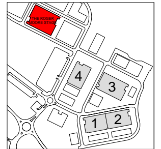
PINEWOOD STUDIOS SITE PLAN

ALL DIMENSIONS TO BE CHECKED ON SITE PRIOR TO ANY COMMENCEMENT OF WORKS