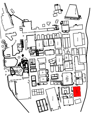
PINEWOOD STUDIOS SITE PLAN

THIS DRAWING IS THE PROPERTY OF PINEWOOD STUDIOS LTD AND MUST NOT BE COPIED OR REPRODUCED IN WHOLE OR IN PART, BY ANY METHOD WHATSOEVER, WITHOUT PERMISSION OR THE WRITTEN AUTHORISATION OF PINEWOOD STUDIOS LTD ALL DIMENSIONS TO BE CHECKED ON SITE PRIOR TO ANY COMMENCEMENT OF WORKS